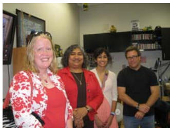
Pictured in Iowa City on June 13, 2011 (from left to right):

Our name arises from an acronym: C ollaborative A rts in R esearch T ranslation for H uman A dvancement. CARTHA means doer in Sanskrit. CARTHA’s story is all about how new forms of cooperative behaviors can be induced among humans: how Collaborative Doers can help make a bigger difference by dedicating themselves to advancing global good no matter their sector, discipline, or location.